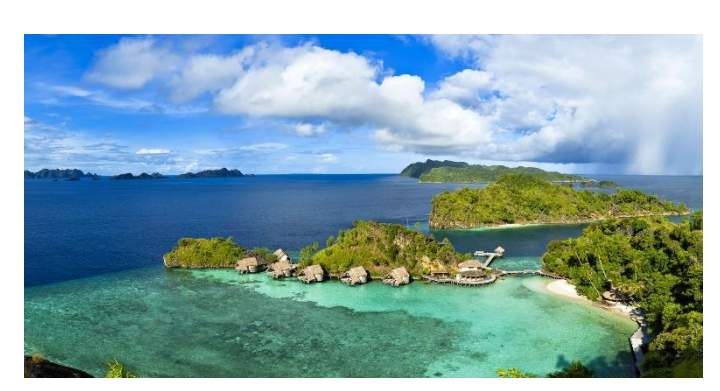
Misool Eco Resort.

Help Save the Oceans, 00:01:01). This is a prime example of how tourism can help organizations preserve their land. The tourists bring in money while spreading awareness of the delicate ecosystem they are visiting. A prime example of tourism money being used to protect areas is the lemur conservation team in Africa. Because of the attention from tourism, this area is now protected by not only the organization, but is now a protected government area where it is illegal to kill the animals living in the area. The blue-eyed lemur is a very endangered creature, on the brink of extinction that inhabits the land. Ever since tourism has created awareness, the lemur population grew from a 1000 on the land to 4000 (Lemur Conservation and Ecotourism in Madagascar 00:05:40). Because of the tourism in the area, the lemur population was able to increase, although the number of lemurs is still significantly small, as long as the conservation team continues to take care of their backyard, the blue-eyed lemur population will grow and thrive.