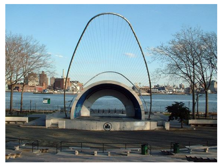
Spider-Man Filming at East River Park.