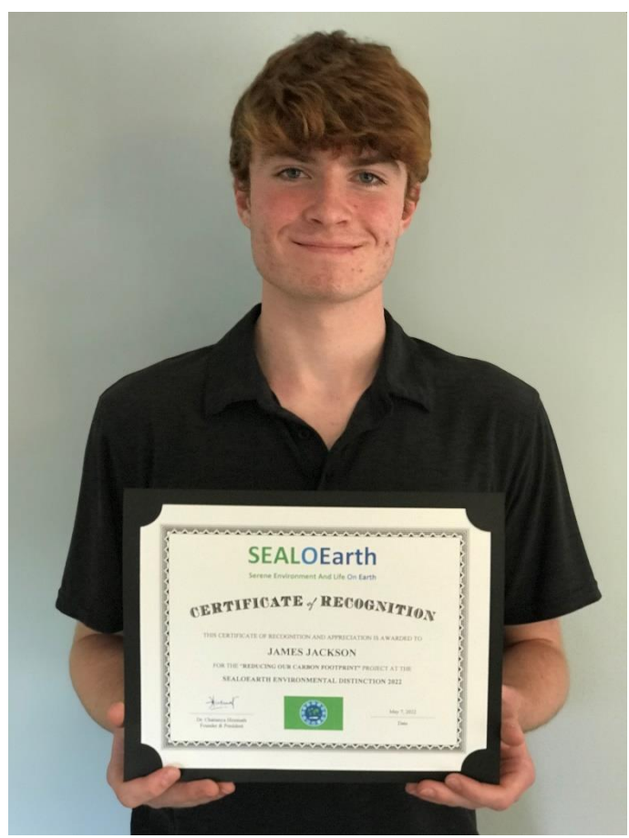
SEALOEarth Environmental Distinction 2022.