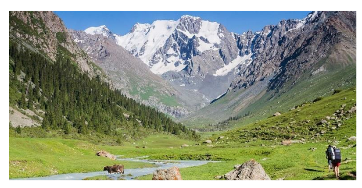
Chon-Kemin National Park.

ecotourism, and the preservation of their local culture while also keeping the environment safe.