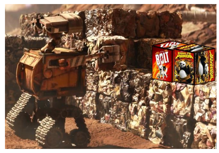
If a lonely robot saved the planet. Photo credit: WALL-E

Earth. After the humans discover that there is plant life on Earth, the captain of the ship realizes that the culture and life of Earth is important and that they shall return to Earth and preserve nature ("WALL·E"). The film depicts a bleak future for the world, one that is definitely possible. The portrayal of this decimated planet along with the unconformably looking "comfortable" life of the humans in space is not simply meant to scare audiences, but rather provide them with a warning, one that is telling them to be careful with their actions of today in order to prevent this kind of future tomorrow.