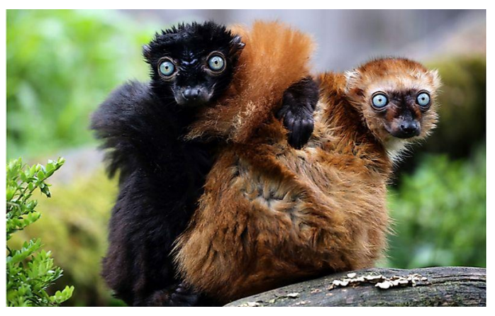
Blue-Eyed Black Lemur.

help remedy this problem. A local group known as the "Park Local Committee" has been working to protect their environment from poachers, fire, and other things that threaten their environment (Lemur Conservation and Ecotourism in Madagascar | 0:04:44 - 0:05:31) However, much of these problems' origins can be traced back to the lack of work in the area. The people in the area poach and cut down trees, selling what they are able to get due to the fact that they aren't able to find work in the area. Luckily the solution to this problem can be found in the very people working to protect the blue-eyed black lemurs. Research groups in the area that have traveled to madagascar with the purpose of learning more about the animals in an effort to protect them. The research group has been able to hire locals to assist them in their research in a multitude of ways. Some of these include navigation, collecting data, and translating the local language (Lemur Conservation and Ecotourism in Madagascar | 0:05:56 -0:06:32). Thanks to the efforts of the Park Local Committee, and the local researchers, the locals now have more work, and the blue-eyed black lemur population can be protected, and hopefully can flourish in the future.