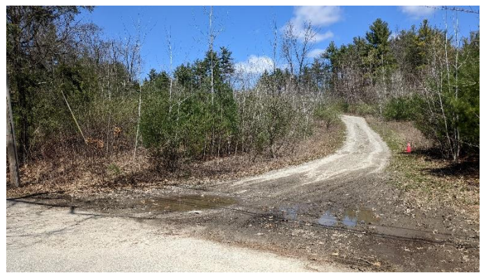
Stratton Hill.

wanted to display more art that can sustain any weather and does not hurt the environment they could put it on this dirt path already in place and it would give more people a reason to go there. This could also create jobs just like the ecotourism in Kyrzygystan ("The Future" 00:00:00-00.20.08). The town of Ayer can hire people to help conserve the land and maybe even commission some art or pave a more concrete path for pedestrians. With a little effort, there can be humongous benefits just from these few acres of land.