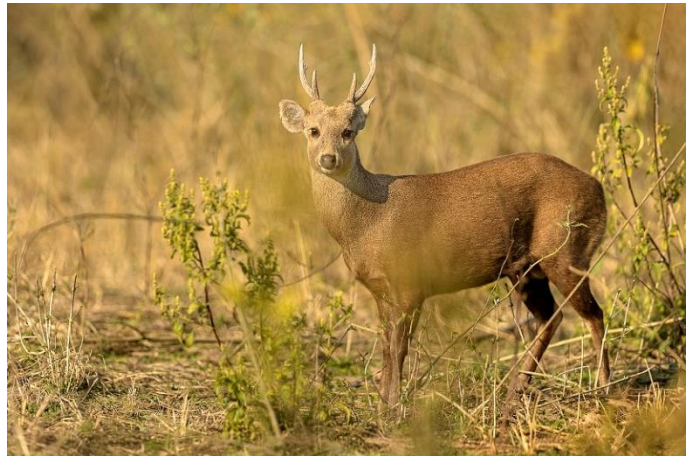
Indian Hog Deer.

Indian hog deer , known scientifically as Axis porcinus , are small deer native to the Indo-Gangetic Plain in northern India, Nepal, and Pakistan. These deer are normally hunted by tigers, leopards, wild dogs, and sometimes by Burmese pythons. The hog deer is listed as an endangered species on the IUCN Red list.