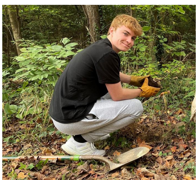
Planting trees.

be a great way to make my project have an even bigger carbon savings impact.