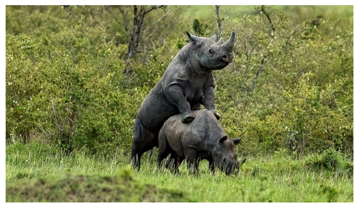
Black Rhino.

and infrastructure developments, all pose as threats to the species.