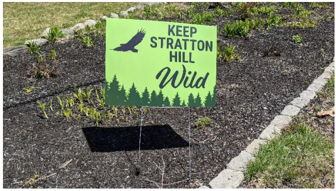
Stratton Hill.

Conserving land and preserving wildlife can help local communities as well as the Earth as a whole. Recently there have been plans put in place to build a new neighborhood in Ayer, Massachusetts. This neighborhood is supposed to reside right on top of Stratton Hill. Stratton Hill is a substantial amount of land in a wooded area in Ayer that is home to many endangered species. One of those species is the bald eagle which is the national bird and a widely known symbol for the United States. If this habitat is made into a neighborhood then a lot of species will lose their home and source of food and will have to migrate to other areas. If local people understand the benefits of ecotourism then they might see why Stratton Hill should remain wild, how they can preserve the land on Stratton Hill, and how maintaining this land can benefit the community and surrounding communities altogether.