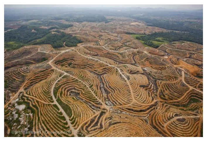
A network of access roads on former orangutan habitat that is now a palm oil concession in Indonesia.

mitigating strategies, we also need to accept the unavoidable effects of climate change and adapt accordingly.