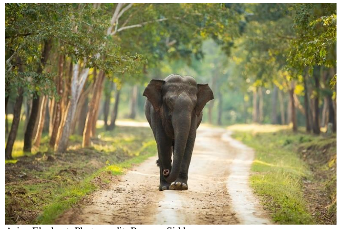
Asian Elephant.

Asian Elephants, also known as the Asiatic Elephants, are scientifically known as Elephas maximus . This species is also considered an endangered species as per the IUCN Red List. The biggest threat to elephants is the illegal trade of its tusks for ivory, as well as habitat loss and fragmentation. Asia is the most populous continent on Earth, so the development and economic growth in different states have led to the encroachment of elephants' habitats, leading to human-animal conflict.