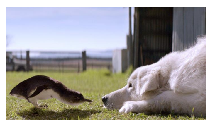
The dogs that protect little penguins – Don Donnison.

Other actions that humans can do to make tourism sustainable is that whenever you travel, go by train that is powered by electricity instead of going by an airplane that uses fossil fuel. This will reduce the amount of carbon dioxide that goes into the atmosphere, and it will help with reducing the adverse effects of climate change. When you are traveling to a local place, you should only buy local and organic food products because they have more antioxidants, and it creates healthy soil which is very beneficial for the environment. We should educate the general public about the benefits of ecotourism to raise awareness.