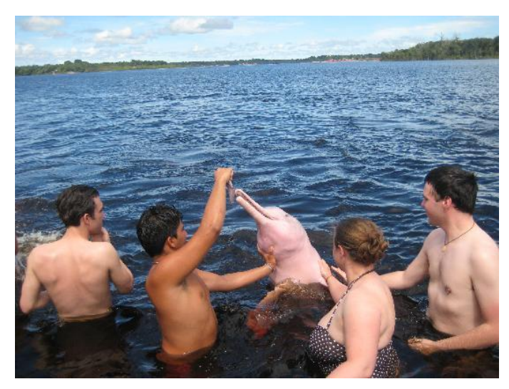
Pink dolphin in the Rio Negro.

One final way a community can benefit from protecting their environment is ecotourism. Ecotourism is a form of tourism where an individual travels to threatened environments in an effort to help protect them. One large example of an ecotourism effort can be found in northern Brazil, along the Rio Negro River. Here, many environmentally friendly sites and activities for tourists can be found. For instance, a hotel completely devoid of all electrical