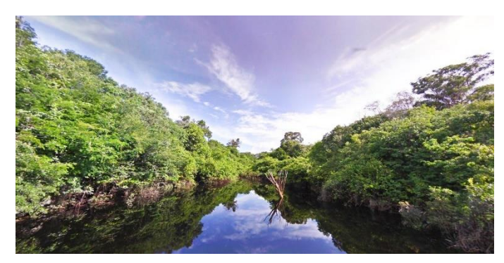
Amazon Basin.

publicly available statistics, only 20% of all tourism qualifies as Ecotourism. Additionally, the World Tourism Organisation says that the industry had about 592 million travelers last year alone, and they spent about 432 billion dollars [The Economist]! Furthermore, there will be around 1.8 billion more travelers by 2030, which is a new record. According to the New York Times, the most popular destinations for ecotourism are Australia, the rainforests of the Amazon Basin, the Galapagos Islands, and Costa Rica [Weiner]. There are three important aspects to ecotourism— environmental integrity, economic vitality, and social equity. This is also known as the triangle of sustainability [Keuten].