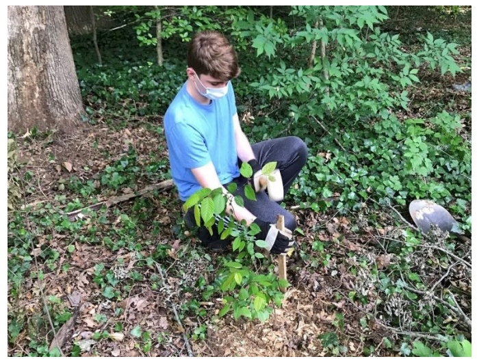
Planting trees.

Switching our electricity source also creates demand for creating more renewable energy facilities, so it helps the electric company to provide more renewable energy to others. Even better, once the funds were raised, all we would have to do is make a phone call to the electric company to have them switch our electricity subscription, so I knew we could be successful.