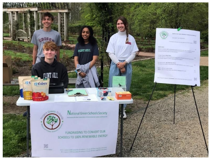
Earth Day 2022.