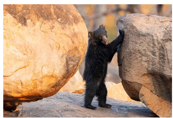
Sloth Bear.

Jaguars are listed as near threatened species as per the IUCN Red List. Hunting & habitat loss due to deforestation continue to threaten the survival of these marvelous cats. Jaguars are excellent swimmers and hunt mainly on caimans. Their bite is the most powerful in comparison to other cats.