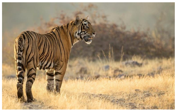
Panthera Tigris.

Tigers (Panthera tigris) are the most beautiful creations made by God on our Planet Earth. The tiger is largest living cat species and a member of genus Panthera . It is the national animal of India, Bangladesh, Malaysia & South Korea and approximately 4000 wild tigers exist in various tiger reserves. Unfortunately, tigers are listed as endangered species by the International Union for Conservation of Nature (IUCN) Red List. Tigers are victims of Human-Animal conflicts, especially in countries with a high population density like India. Poaching is another reason for tiger deaths since its organs, like bones and teeth, are used for medicinal purposes.