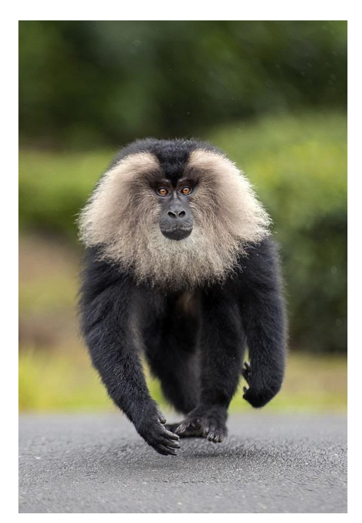
Lion-tailed Macaque. Endangered species listed by International Union for Conservation of Nature (IUCN).

We hope that you will enjoy reading this newsletter!