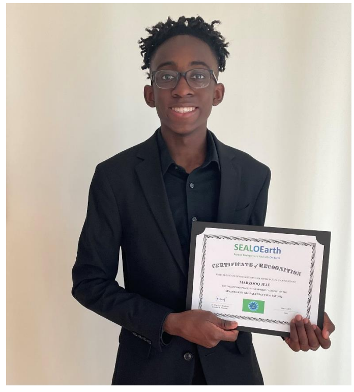
SEALOEarth Global Essay Contest 2022.