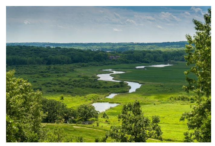
The Pheasant Branch Watershed.

the reserve than just outside" ("Can Eco-tourism" 00:06:19 -00:06:40). Ecotourism creates jobs that can both benefit the community and their surrounding environment. In Madagascar, there is an indigenous rare species of Lemurs that have blue eyes in fact "there are only 60 blue-eyed black lemurs in zoos" ("Lemur Conservation" 00:00:40). Due to this rare species being endangered and close to extinction, this community has decided to practice ecotourism to help save blue-eyed lemurs. There is a committee of local people who patrol, and control the local parks ("Lemur Conservation" 00:04:40 - 00:05:14). These people can protect the lemurs from poachers so that tourists can continue to come to Madagascar and experience viewing the Blue-eyed black lemurs ("Lemur Conservation" 00:05:18). There are also guides, porters, and people who wash the clothes of tourists that generate income for the Local people ("Lemur Conservation" 00:07:14). The types of Jobs created by ecotourism are almost endless, there are so many different types of work that the community can participate in, so there is always something for somebody.