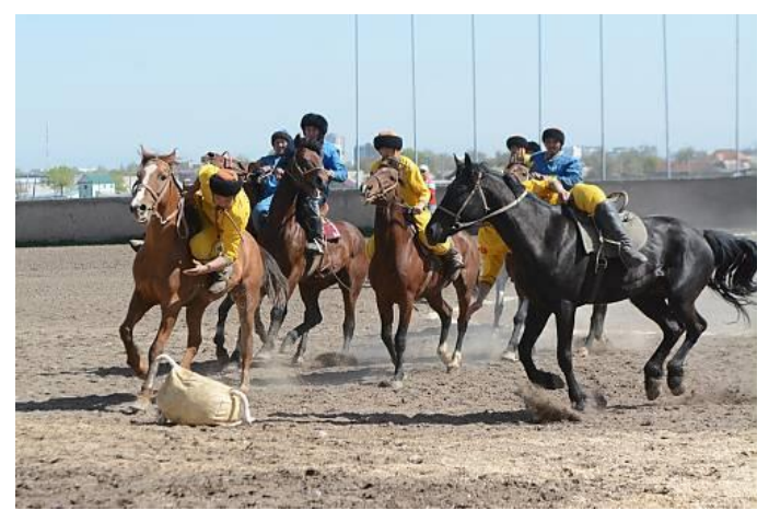
Kok boru, traditional horse game.

Culture is something that is very easy to share, and can be learned about by anyone. Things as simple as playing games and just enjoying the food from another culture can help preserve the culture for generations to come. Ecotourism just increases the effectiveness of the spread and preservation of culture by bringing in people from all other the world to have amazing experiences with new cultures while also protecting the environment.