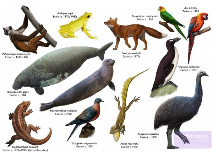
Animals that went extinct in recent times thanks to humans (Reddit). Photo credit: Art by Gabriel Ugeto

availability, and developing crops resistant to extreme climates ("Responding to Climate Change"). Finally, we need to take more steps to protect endangered birds and animals by preserving their natural habitat. In order to safeguard the future of the Earth, people need to not only find ways to limit future damage to the environment, but also prepare for future adverse impacts of climate change.