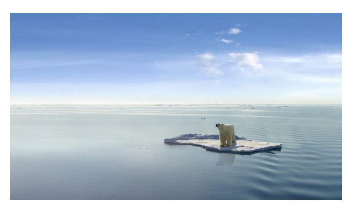
11 facts about global warming.

We need to implement mitigation strategies to bring back the balance between people and nature. We can start by creating awareness of the damage we are causing to Earth. "Despite increasing awareness of climate change, our emissions of greenhouse gases continue on a relentless rise" ("Responding to Climate Change"). Reducing dependence on fossil fuels and planting more trees can reduce the carbon dioxide levels in the atmosphere. We can also help by conserving natural resources. Simple acts such as conserving water and electricity, recycling paper and plastics, and reducing food wastage can go a long way in protecting the Earth. Composting foods can help reduce the amount of waste that ends up in landfills. Adopting a few manageable acts to mitigate the risk of climate change can save our environment.