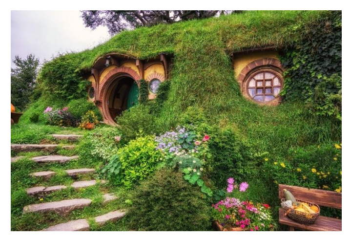
If a lonely robot saved the planet. Photo credit: WALL-E

focus of this essay, filmmaking. The industry is recognized worldwide and as such, no matter where a film is produced it can easily garner critical acclaim from the masses across the globe. Because of this, when a movie does well viewers may be inclined to visit key landmarks from the film, and there is no greater example than Peter Jackson's, The Lord of the Rings Trilogy. The film franchise has made well over billions in sales and coincidentally features a massive and dedicated fanbase. All three films were shot in New Zealand and took full advantage of the nation's beautiful landscape to bring Tolkien's writings from the original books to life. Following the releases of the films, fans were ecstatic over the idea of visiting New Zealand to check out the major landmarks from the films such as Mount Doom and even walk the path to Mordor like Frodo and Sam. As a matter of fact, following the films' debuts New Zealand saw a 40% growth in the annual influx of tourists from 1.7 million in 2000 to 2.4 million in 2006 ("Tolkien Tourism"). Bruce Lahood the US and Canada regional manager for Tourism New Zealand has even been quoted as saying, "You can argue that Lord of the Rings was the best unpaid advertisement that New Zealand has ever had" ("Tolkien Tourism"). This is just one example of films being able to promote the beauty in nature of various countries all around the world.