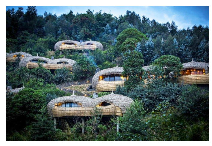
Stunning treehouse retreat in Rwanda sets a new standard for ecotourism.

from tourism, and ecotourism is a great opportunity for that. Ecotourism can create numerous jobs locally, such as being a tourist guide, selling food and/or accessories, and providing accommodations. Luckily, money from tourism projects are shared by everyone, and they are going to be invested in the communities who are hosting tourists. This can produce new infrastructure for the community, like building schools for kids, building new roads, facilities and accommodations for tourism. This will be very beneficial for the community's future. According to The Economist, the coral reef diving tourism project invested about 36 billion dollars annually [The Economist]! Also, Brazil has developed a very large business of ecotourism, making it boom with about 7 billion dollars per year! Furthermore, according to the New York Times, Rwanda, a country in Africa, earns 9 million dollars in revenue from tourists, and a million dollars in national park fees every year [Weiner].