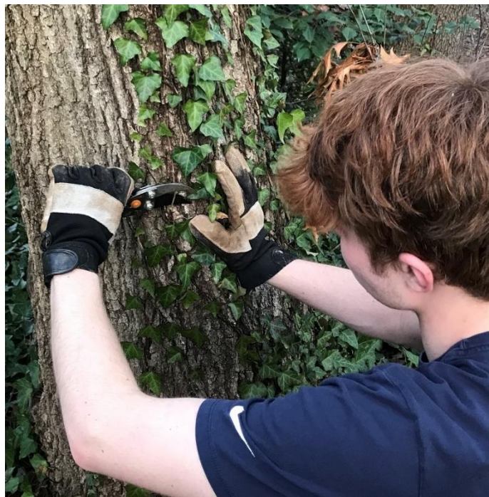
Clipping Ivy.

saved about 20,000 pounds of carbon that year, I realized this project did not even outweigh the carbon produced by two average cars driving for a year. Since improving climate change was my ultimate goal, I decided I wanted to do something that saves more carbon.