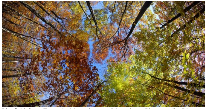
Pittsfield State Forest in Massachusetts (Mongabay).

The environment is one of the most important things to our world, and our society. However, in our modern world, it feels as if it has been cast to the wayside. Every year 15.3 billion trees are cut down (Mongabay), and millions of animals are illegally poached (Animal Matters). If no action is taken to stop these tragedies, then one day there won't be any environment for us to call home. However, if the people of our planet work together, there is hope for nature. There are numerous ways in which small communities can take action to save their homes, while also benefiting from the process. Some of these methods include, using renewable energy sources, working to patrol and protect environments that are endangered, as well as practicing ecotourism.