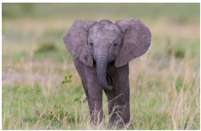
Adorable African Elephant calf.