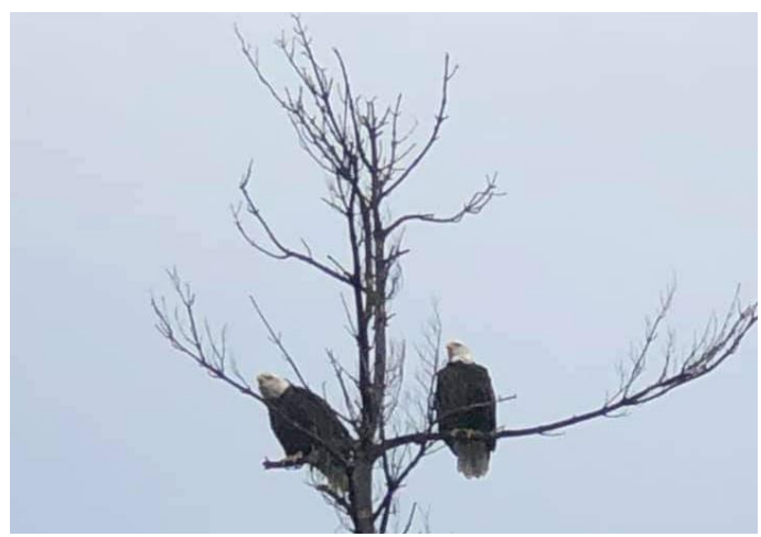
Bald Eagles at Stratton Hill.

Conserving land and preserving wildlife can help local communities as well as the Earth as a whole. Recently there have been plans put in place to build a new neighborhood in Ayer, Massachusetts. This neighborhood is supposed to reside right on top of Stratton Hill. Stratton Hill is a substantial amount of land in a wooded area in Ayer that is home to many endangered species. One of those species is the bald eagle which is the national bird and a widely known symbol for the United States. If this habitat is made into a neighborhood then a lot of species will lose their home and source of food and will have to migrate to other areas. If local people understand the benefits of ecotourism then they might see why Stratton Hill should remain wild, how they can preserve the land on Stratton Hill, and how maintaining this land can benefit the community and surrounding communities altogether.