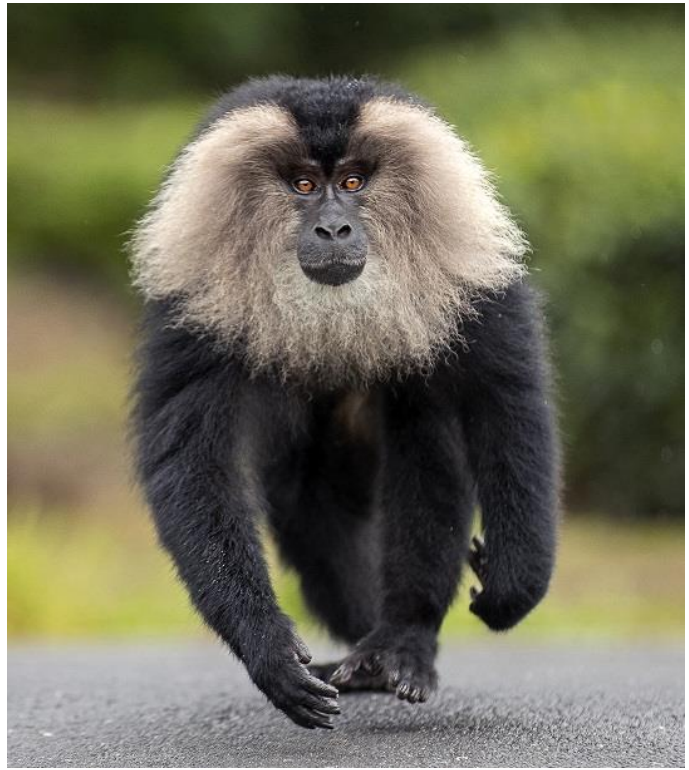
Lion-tailed Macaques.

only a few groups of lion-tailed macaques left in the area. Lion-tailed macaques are rainforest dwellers. They are diurnal, which means that they are mostly active during the day. They are also excellent tree climbers and prefer to live on top on the upper canopy of tropical evergreen forests. Unlike other macaques, lion-tailed macaques mostly avoid humans. They mainly feed on fruits, leaves, and berries, and rarely prey on birds' eggs.