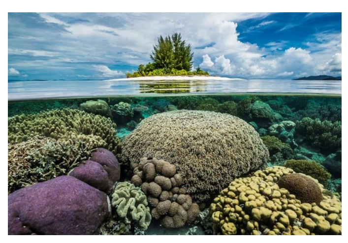
Saving Raja Ampat's marine biodiversity.

from all over the state to come and visit. The Friends of the Pheasant Branch Conservancy is an organization that works "To restore, protect and promote the Pheasant Branch Conservancy and watershed for today and tomorrow" ("Mission, Purpose"). The organization is able to protect the Conservancy, by gathering volunteers to help maintain the lands and make sure they grow in healthy ways. Every couple of years I was able to witness The Friends of the Pheasant Branch Conservancy burn the prairie lands. This is extremely important for the environment because the burning of the prairie lands allows for the dead plants to be released, and provides nutrients for the prairie plants (Simmons). The Friends of the Pheasant Branch Conservancy hires naturalists to provide education programs, field trips, and tours to K-12 students in the nearby area ("Recruiting Naturalist"). Hiring people to teach about the Pheasant Branch Conservancy, works to maintain a culture of protecting the environment around oneself. The Misool Eco Resort, the lemur conservation efforts in Madagascar, and The Pheasant Branch Conservancy all practice ecotourism, and through ecotourism they are able to protect their surrounding environments, in differing ways.